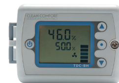
Digital Duct Humidistat