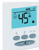
Digital Wall Humidistat